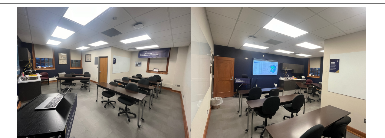
Figure 3: New Weather and Climate Lab in the Atmospheric and Environmental Sciences wing of the remodeled McClauray Building.