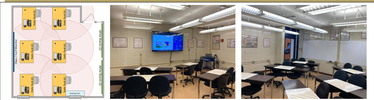
Figure 2: Original Weather & Climate Lab Before & After Removal of In-Lab Computing Workstations. Left, Configuration Schematric for Academic-Year 2020-21 with COVID Distancing. Center & Right Academic Years 2021-22 and 2022-23 Photos.

Before the start of the 2022-23 Academic Year (AY), the previous lab orientation (Figure 2, left) was converted into the "desktop-less" orientation (Figure 2, center, right), and the aging desktop computer units were reassigned. This academic year also saw the relaxing of COVID-19 room capacity restrictions (6 students), and the room was permitted to operate at a higher capacity of 12-18 students with new desks provided from university surplus at no cost to the program or equipment grant. For reference, the maximum pre-COVID-19 capacity for the room was a maximum of 12, with two students having to share each of the six LAN-connected workstations.