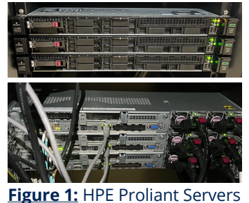
Figure 1: HPE Proliant Servers ("Gale," "Cyclone," and "Chinook") deployed in South Dakota Mines' ITS facilities.

Once final vendor quotes were received, initial purchases for the equipment HPE servers were made in early August 2021 and were fulfilled, shipped, and arrived at South Dakota Mines by the close of that month. The three server units were loaded with Ubuntu 20.04.02 LTS (since then, upgraded to Ubuntu 22.04.03 LTS) and were installed into existing racks in the university Information Technology Services server room (Figure 1). Later, in January 2022, Intel One-API HPC compilers were installed on the HPE ProLiant servers, and the associated meteorological support packages (e.g., NetCDF) were updated from GCC- to Intel-built libraries.